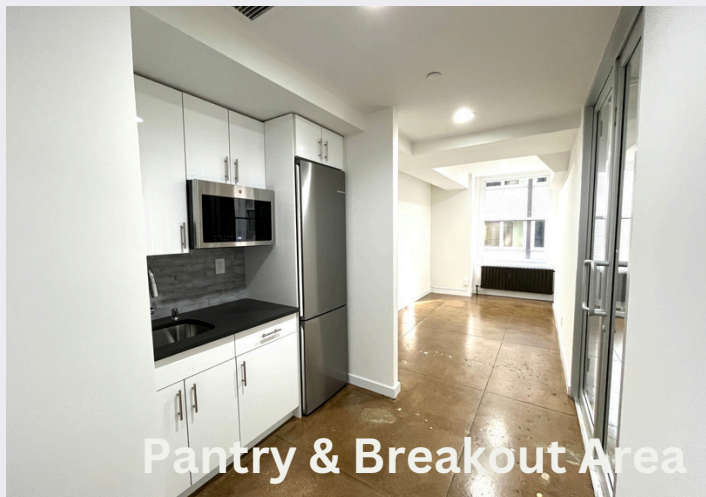
Pantry & Breakout Area